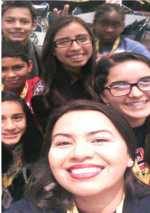
Engaging & connecting with team members