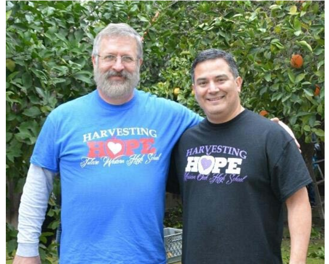
Mentoring other advisors