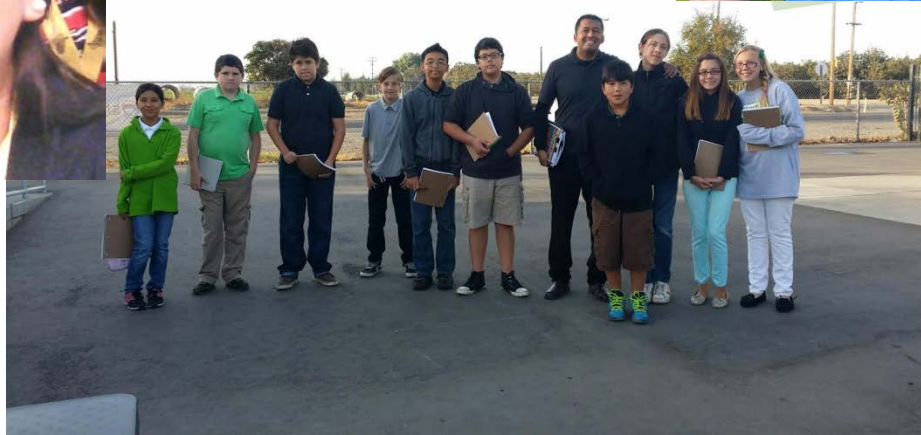
Working with their team